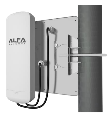
N2C can direct mount on APA-L2414M